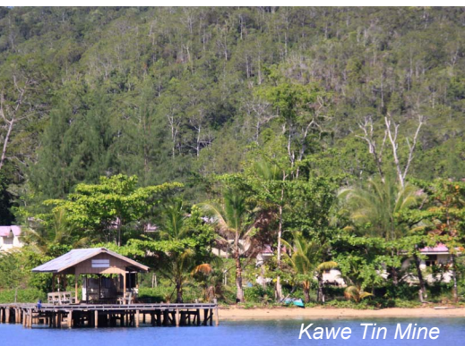
Kawe Tin Mine

Teluk Alyui 0°12.218'S 130° 12.568'E - Conservation mooring, by White dive arrow location. Permission to do anything in bay must be done via VHF87 to the Cendara Pearl Farm (use some bahasa ), as these folks actually lease the whole bay from the villagers. Unfortunately for us, the village has just instigated claiming another fee per boat also, must be paid before you are allowed to do anything in bay (even to visit Pearl Farm) Currently 1,000,000 IDR! Pearl Farm employees suggest you ring them first to see what the current story is, and if need to pay then you need to go to the village as you enter the bay on the southern side, Selepele. The bay is very pretty, but we opted to leave early the next morning. There are 3 mooring buoys, the other 2 belong to the Pearl farm. There is a small pass in the islands immediately north of farm. Very pretty, indeed. Saw dolphins and turtles, and more mantas at the entrance of the bay. Pulau Me also pretty, but we did not stop.