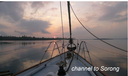
channel to Sorong