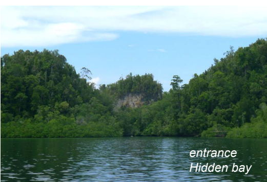
entrance Hidden bay

Kabui Pass / 00°25.396' S 130° 34.300E - Plenty of anchorage choices. 42ft Very calm. Small homestay on southern corner, fresh water supply, need to pay for same.(10,000. IDR seemed to keep them happy) Our dingy with its 2hp motor was not up to the pass, even thou we attempted it when we thought it was calm.. So buddied up with some other yachties, and took one dinghy in, and someone drifted with that as we snorkelled. The coral was Dr Suess stuff, interesting colours, not the same we have been use to looking at and because of the current very murky. Lots of local boats go thru with tourists, or just making there way home.