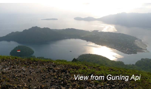
View from Guning Api