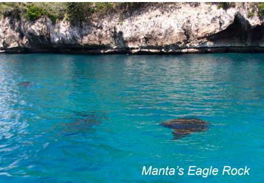
Manta's Eagle Rock

Batangpele 0°19.095'S 130° 12.882'E - also used this location 0°19.511'S 130° 12.158'E , lots of currents. But when tides turn the snorkeling off the boat was very good. Great array of corals. Fish jumping in bay constantly. Sting rays doing somersaults by the boat. Peaceful. Phone reception, no internet.